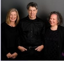
July 8 Trio Sefardi