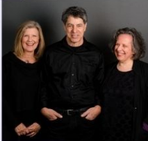
July 8 Trio Sefardi